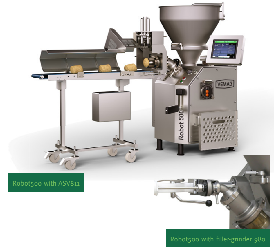
Robot500 with ASV811